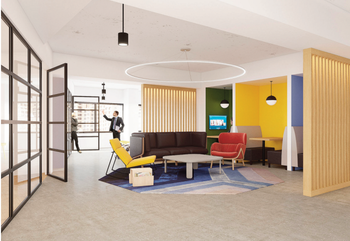
Accelspace: Rendering by CORE architecture + design

D LR Group is pleased to announce two new hires.