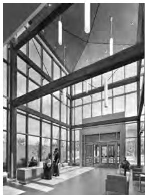
Valley Health Cancer Center