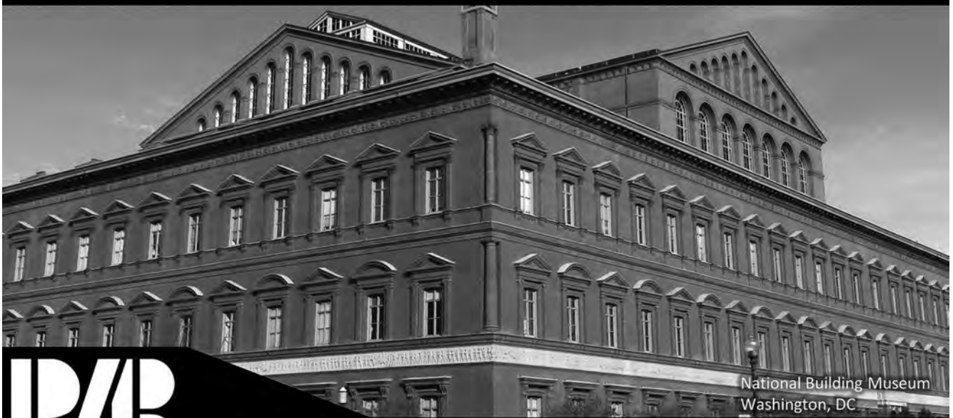
National Building Museum Washington, DC

BEEN HERE FOR 130 YEARS. BE HERE FOR AT LEAST 130 MORE.