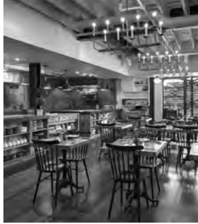
The Dabney, designed by Streetsense