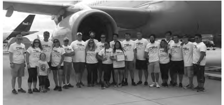
GPI Dulles Plane Pull