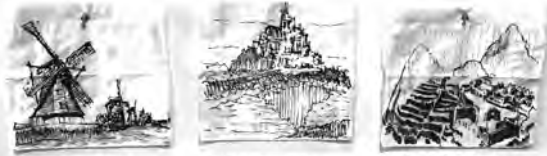
Torti Gallas Napkin Sketch Winners