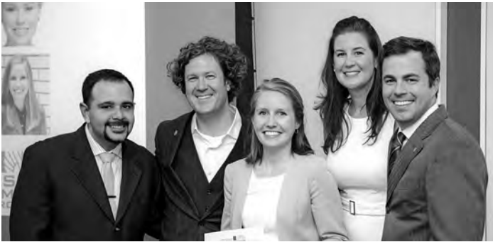
Christopher Kelley Leadership Development Program

AIA | DC members may submit "Member News" items to newsletter@aiadc.com .